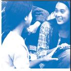
■ Figure IV.b ■